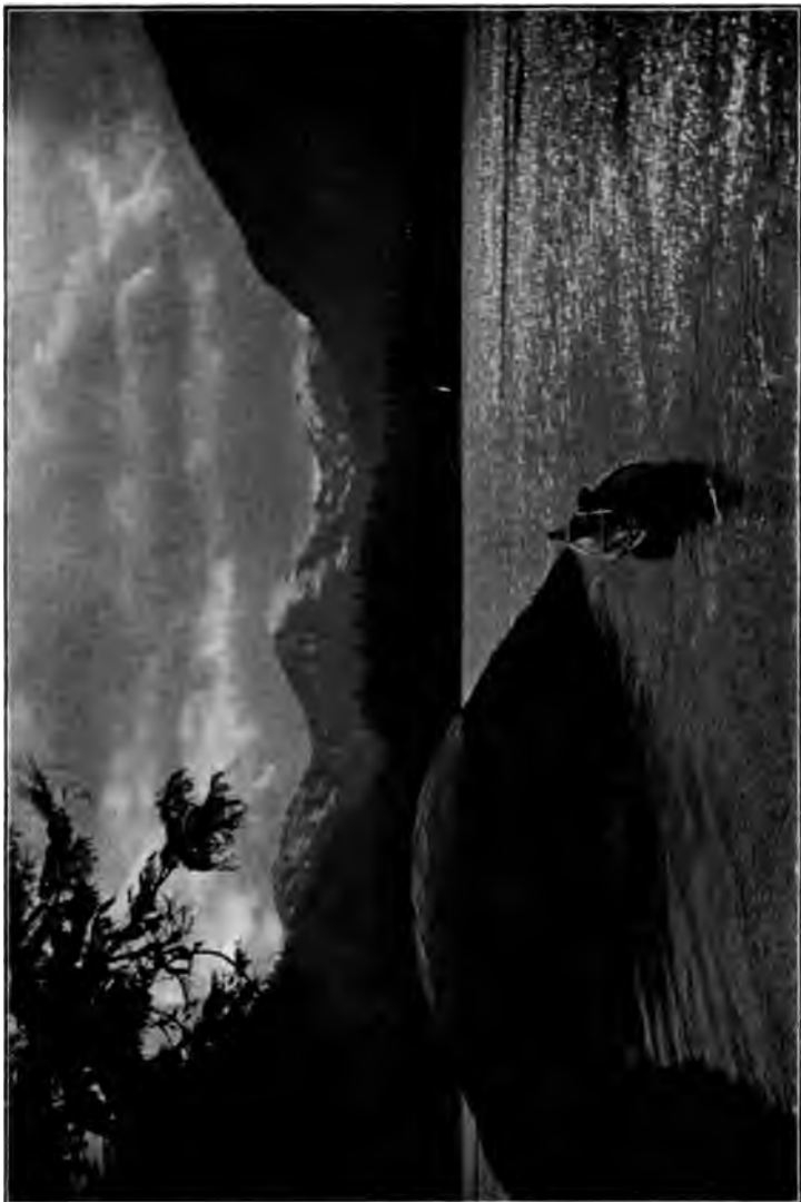
LOWE INLET, BRITISH COLUMBIA